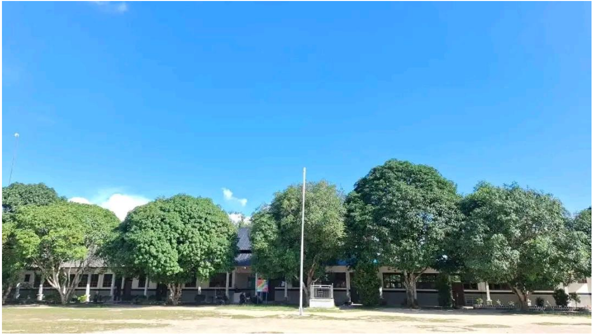
Gambar 3 SMA Negeri 1 Silangkitang