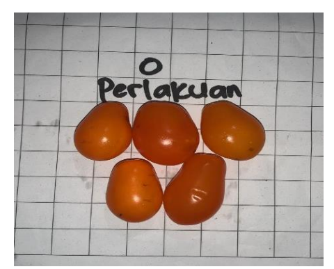
Figure 2. Control treatment plant yield

Notes: Mean values in each column followed by the same letter indicate not significantly different at 5% BNT.