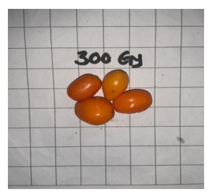
Figure 3. Plant yield of 300 Gy gamma dinar dose treatment.