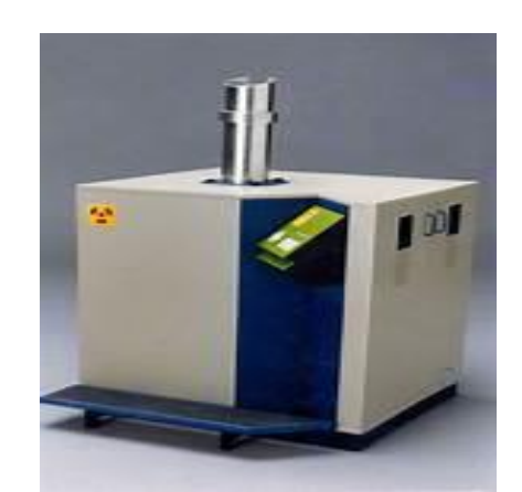
Figure 1. The gamma chamber device

The materials used in this research are seeds of Cherry Golden tomatoes, black soil, and compost. The tools used in this study are the gamma chamber 4000 A, polybags, digital scales, meter, writing tools, and a camera.