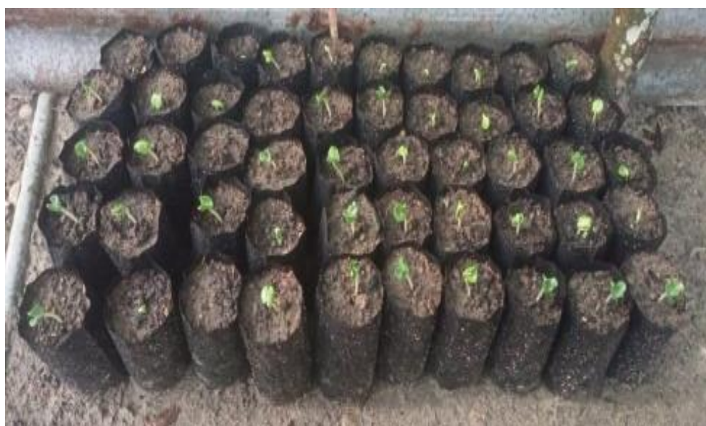
Figure 1. Green Okra 3 Day After Planting (DAP)

Description: Percentage of living plants and dead plants