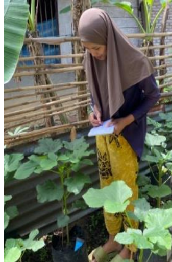
Figure 3. Measurement of the number of leaves