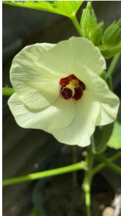
Figure 5. Green Okra Flower

In this study, the flowering age at a dose of 0 Gy (control) was the fastest to appear flowering. Meanwhile, for the gamma-ray irradiation treatment, the fastest flower appearance was at a dose of 500 Gy, and the slowest flower appearance was at a dose of 900 Gy. This study shows that gamma-ray treatment can affect flowering age differently. This study is in line with Insani et al., (2022) , who stated that high doses of gamma-ray irradiation could inhibit the flowering of tomato plants due to damage to the chromosome structure, which results in a longer flowering age.