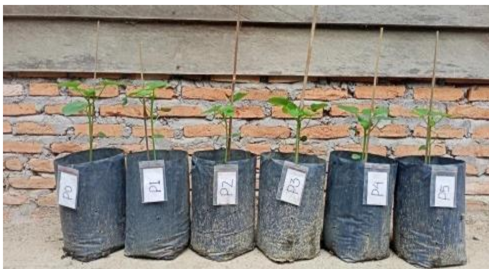
Figure 2. Green Okra on 2 WAP

Description: Numbers followed by different letters in the same column indicate significant differences based on the 5% DMRT test.