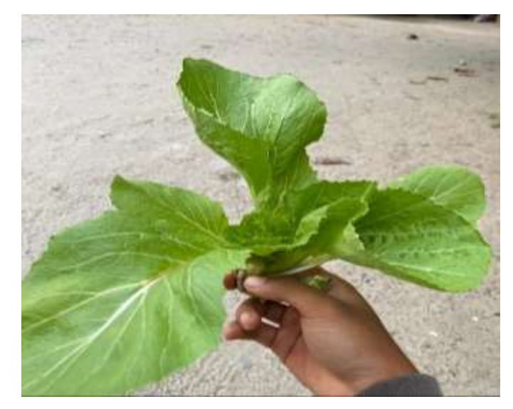
Figure 4. The harvest of bitter mustard plants