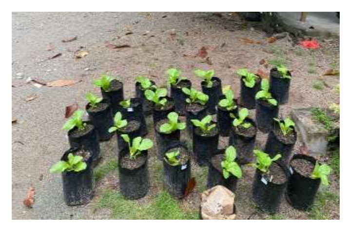
Figure 2. Growth of bitter mustard plants