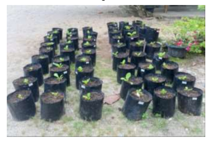
Figure 1. Sowing and planting bitter mustard seeds

The research results are shown in the image below: