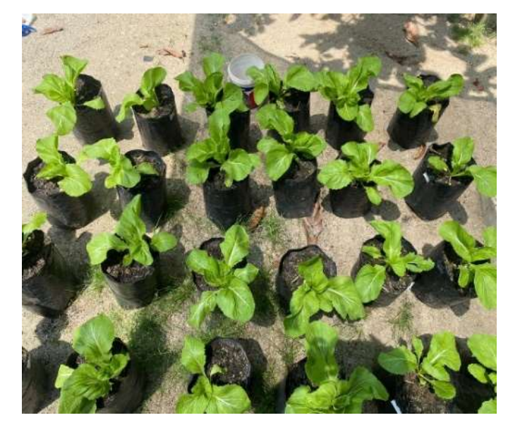
Figure 3. Bitter mustard plant