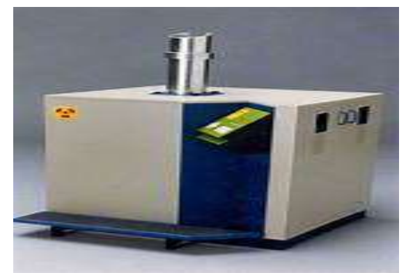
Figure 1. Gamma Chamber 4000 A

The materials used in this study plant seeds, black soil, and were compost. The tools used in this study were gamma chamber 4000 A, polybags, digital scales, meters, stationery, and cameras.